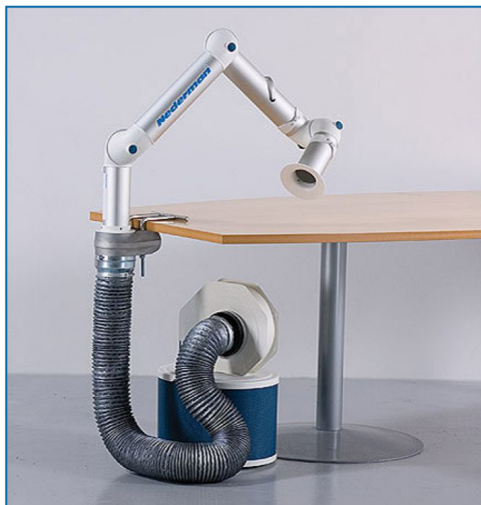
Benchtop Extraction Kit 3000