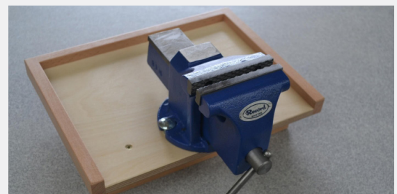
Optional - Vice Tray for Metalworking Vice

AES OFFER INSTALLATION AND SERVICE SUPPORT FOR ALL EQUIPMENT