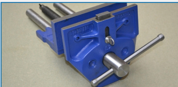
7" Woodworking Vice (Without Fixing Kit)

This is the ideal vice to tackle any educational project or material in the workshop.