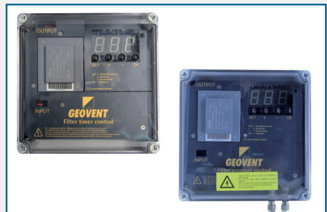
Advanced control of the filter for maximum performance.