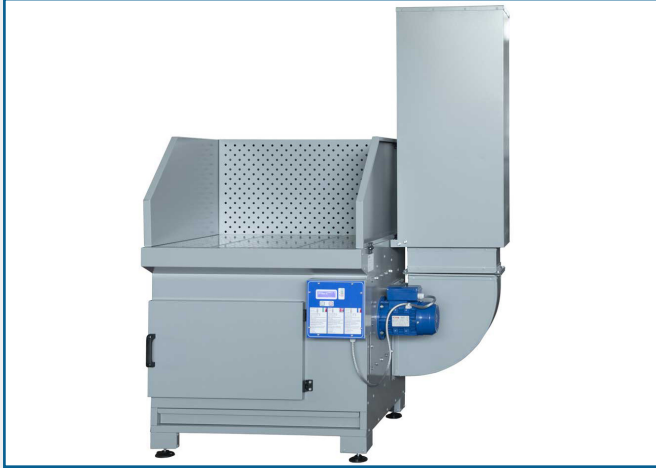
GDB10 with optional side mounted silencer (-10dB).