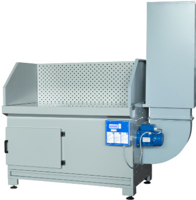
Model shown - GDB15 with optional side mounted silencer