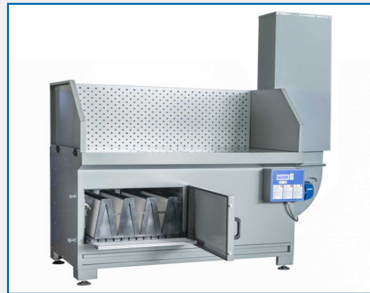
Model shown - GDB15

Front loading maintenance access for filter change.