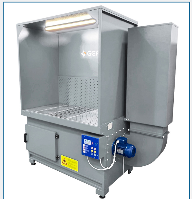
GDB-15 with optional side mounted silencer and enclosure with LED light.

AES OFFER INSTALLATION AND SERVICE SUPPORT FOR ALL EQUIPMENT