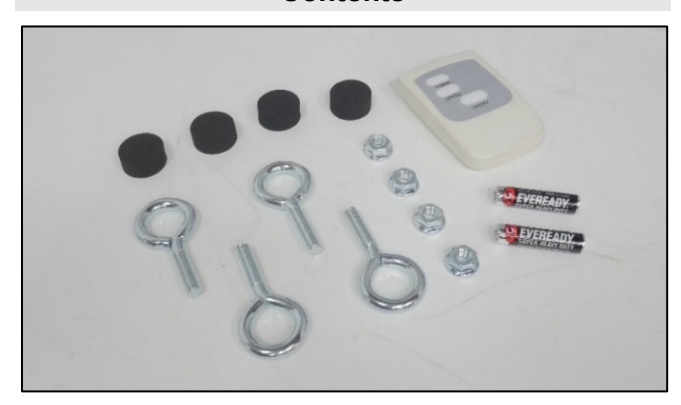
Air Filtration Unit (4) Rubber Feet (4) Ceiling Mount O-Screws (4) Ceiling Mount nuts (2) Batteries for Remote Remote