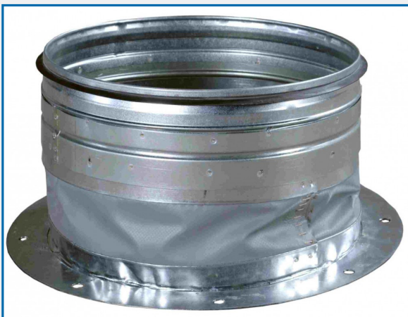
Flexible Inlet Adapter